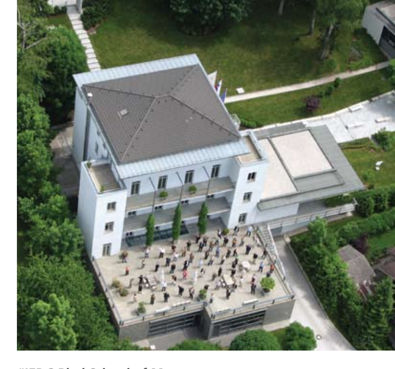
"IEDC-Bled School of Management, the best small-business school in Europe" (The Independent)